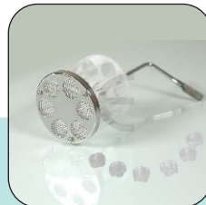
Six tube basket assembly with guided disc (Set of 2) for EDI-2 Part no - 0202A00009