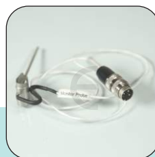
External temperature probe for EDI-2 Part no - 0213B00001