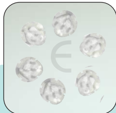
Guided disc for six tube basket assembly (Set of 6) Part no - 0201A00004