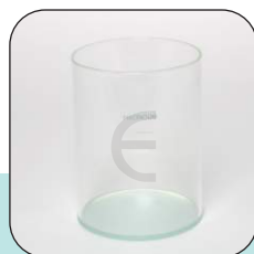
Glass beaker (1000 mL) Part no - 0213A00001