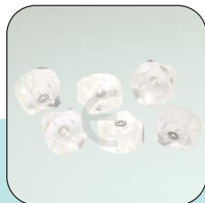
Magnetic guided disc (Set of 12) Part no - 0201A00007