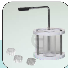
Three tube bolus basket assembly with guided disc (Set of 2) for EDI-2 Part no - 0202A00010