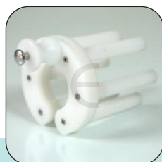
Disc handling device Part no - 0201A00018