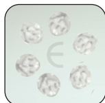
Guided disc for six tube basket assembly (Set of 6) Part no - 0201A00004