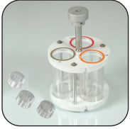
Three tube bolus basket assembly with guided disc (Set of 2) for EDI-2SA Part no - 0201A00010