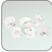
Magnetic guided disc (Set of 12) Part no - 0201A00007