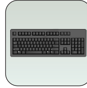
PC keyboard Part no - 0201B00053