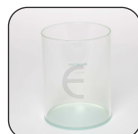
Glass beaker (1000 mL) Part no - 0213A00001