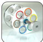
Six tube basket assembly with guided disc (Set of 2) for EDI-2SA Part no - 0201A00009