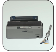
Printer Epson LX-310 plus Part no - 0201A00020