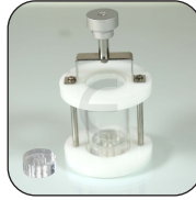
Single tube bolus basket assembly with guided disc (Set of 2) for EDI-2SA Part no - 0201A00011