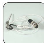
External temperature probe for EDI-2SA Part no - 0213B00001